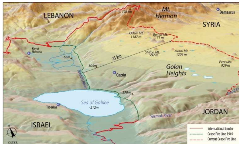
Figure 1: Map of the Golan Heights Plateau, 2019

Over the ensuing centuries, the sovereignty of the Golan changed hands many times, frequently as a consequence of conquest in battle: Jewish tribes populated it abundantly as settlers, gentile tribes passed through occasionally, largely as nomads. Prevailing standards favor permanent settlements as conditions-precedent to sovereignty. Golan is Jewish historically. Morality is on the side of recognizing Israeli sovereignty over the Golan Heights.